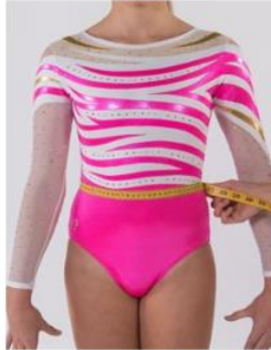
WAIST Measure around waist at navel.