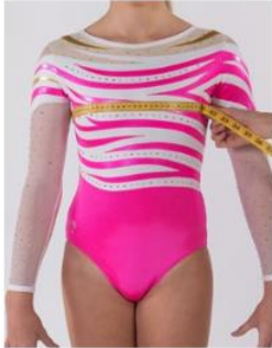
CHEST With arms by side, measure around the fullest part of chest.

The aim of measuring your athlete is to find the most appropriate size based on the size chart below. Please ensure that athletes are wearing fitted apparel during the measuring process.