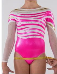
HIP Measure around the fullest part of buttocks.